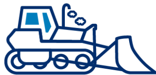
Machinery & Equipment